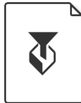
Tutorials & Guidelines