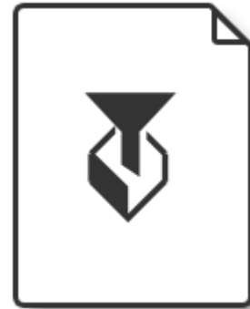
Tutorials & Guidelines